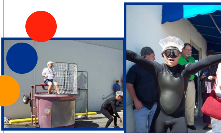
Piedmont Natural Gas gets dunked for United Way!

Submit photos of your United Way event and we may include them on our website, www.cfauw.org or in this newsletter.